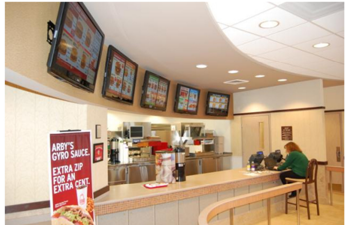
Digital Menu and Marketing Boards

For restaurants with multiple locations, Corporate can centrally manage content for the store’s menu board, eliminating the need for input at the individual store level.